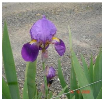
Moa 1919 TB-M-B7D ? x Dominion