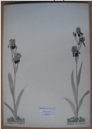
Zulu 1920 TB-B3D Dominion x ?

Vigorous growth, and of rapid increase. Foliage glaucous green 22-26". Flowering stems 28-30", straight, 5 flowered. Flowers close, well proportioned, stiff. Standards domed 2 3/8 x 2 3/8", bright rosy lavender, Falls drooping, blade 1 3/4 x 2 1/4", rich auricular purple with white beard tipped pale orange. Flowering for 3 weeks from 26.5.1927 (RHS Trials)