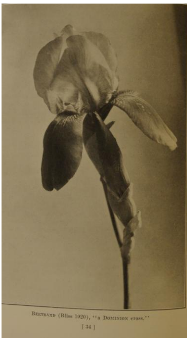
Bertrand. 1920 TB-M-B3M Trosupurba x Dominion

Standards light lavender violet reticulated with brownish violet, slightly bronzed. Carriage cupped, arched; blade obovate, fiddle form, notched, undulate, ruffled to frilled, revolute, creped and cockled 1¼ x 2¼". Falls silvery mulberry purple to florite violet veined with same to brownish on lavender outer haft. Carriage flaring to drooping, wedge shaped, convex, obcordate, smooth 2x3". Beard: fine, dense, projecting, brown. Haft narrow deeply channeled, reticulations fine to broad, widely spaced. Style branches broad, overarching. Crest large, fringed, plentiful pollen. Spathe valves scarious, inflated. Form: short to long, compact, oblong to rounded, free flowering. 34", fastigate branching, low, (below centre) poor-good substance, frail-firm texture, Growth Exceedingly vigorous, increase rapid, habit regular, foliage stiff, slender, glaucous green tinged at base. 3 blooms at once, floriferous. Stalk erect to flexuous with 9 buds. Neglecta type, good fragrance. (Cornell University #100)