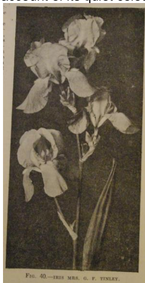
Mrs Tinley 1919 TB-EM-B3M Loppio x Dalmatica

Very early and free flowering. Standards coppery pink and Falls deep rich rosy purple. Very striking and beautiful on account of its quiet colouring. 27" (Whitelegg: 1920)