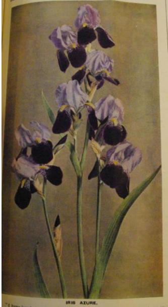
Azure. 1919 TB-M-B3D Leonidas x Maori King (same pod as Dusky Maid)