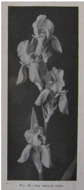
Phyllis Bliss 1919 TB-MLa-R1L sweet lavender x macrantha