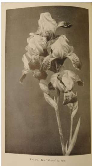
Midas 1920 TB-M-Y9M Jacquesiana x Mrs Neubronner

Knysna is good though somewhat small. Still, the pure yellow colour and good shape of the standards, coupled with its tall branching habit give it almost pride of place amongst all the clear yellows in cultivation today. (Gardeners Chronicle: 1922)