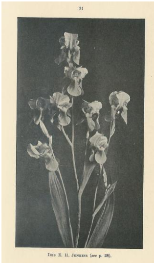
E H Jenkins. 1919 TB-M-B3M Princess Beatrice x Trojana

A strong growing variety with tall branching spikes. Standards white slightly veined and penciled mauve, Falls long, wide and spreading, of fine shape, faintly veined with lavender towards upper half. Very decorative as a cut flower. This is one of the most distinct of Mr Bliss's seedlings. Soft colouring will appeal to all. 3'. (Wallace 1920/21/22/24)