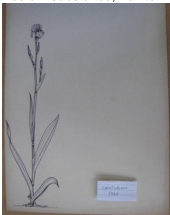
Centurion 1920 TB-B3D obsolete? AIS checklist 1939 (superseded Wills 1950)

Standards lavender, white at edges plicated with deep lavender. Domed arching, blade ovate -obovate, notched undulate, ruffled and frilled, recolate 1\frac{7}{8} \times 2\frac{1}{4} ". Falls lavender white to glistening white plicated with deep lavender, reticulated with red-violet, slightly ruffled 1\frac{5}{8} \times 2\frac{3}{4} ". Beard coarse, dense, projecting conspicuous, white tipped with yellow. haft broad ovoid overarching, crest small fringed pollen plentiful, spathe valves scarious. growth moderate, increase rapid, habit compact, foliage stiff, slender deep glaucous green. 3 blooms at once, floriferous ,stalks; fastigate branching erect to angular with 8 buds, 3 laterals. fair - good size, short-long form, compact rounded. 28-40" medium substance, frail to firm texture good fragrance. (Cornell University: #100)