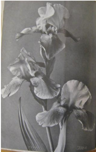
Titan 1919 TB-LaM-B3M Dominion x Trosupurba

Graceful in form and outline, with flowers of self pale rosy lavender. Flower spikes very strong and erect growing. One of Mr Bliss's most beautiful and distinctive seedlings. (Wallace 1922)