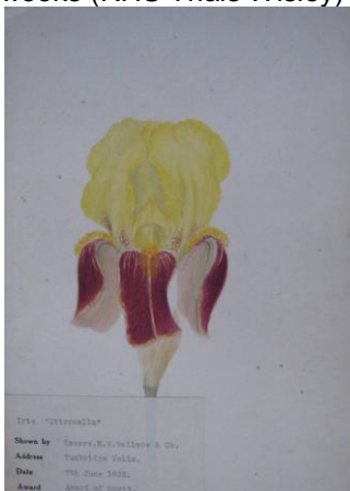
Citronella 1922. Mla-Y9D (Mme Chereau x Jacquesiana)x(Queen of May x Cordelia)

Habit of Abdera . Foliage 24". Flowering stem 36" straight 7-8 flowered, flowers large, well proportioned stiff, scent faint. Standards domed 2\frac{3}{4} \times 1\frac{1}{4} ", pale bluish violet with smoky brown veins at base. Falls drooping 2 \times 2\frac{1}{4} " rich velvety nigrosin-violet. Beard orange in upper half. Near Dominion but paler. Flowering from May 23rd 1927 for 3 weeks (RHS Trials Wisley)