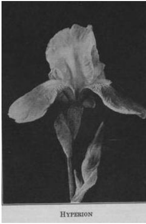
Hyperion 1921 TB-M-B3D Trosupurba x Dominion