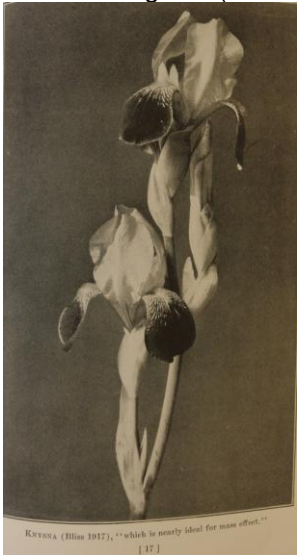
Knysna 1917. IB-M-Y9D Maori King x Jacquesiana

Lightest blue-toned flower of the Dominion race. Standards bluish lavender. Falls clear bright peroma violet. Strong grower. 3'6". Light blue toned flower of fine but rather long form. Very large flower with long arching Standards of bluish lavender 2 5/8" broad. Falls 2 1/8" broad smooth and hanging with tilted tips, bright peroma violet. Branching, free flowering 3' 2"(AJB 1920/21 + 1921/22)