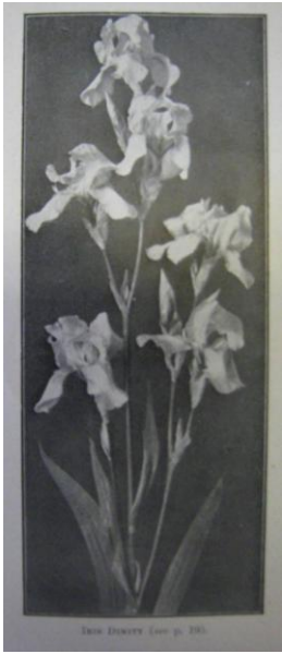
Dimity. 1919 TB-M-W2 Mme Chereau x Cordelia) x (Mme Chereau x Queen of May)